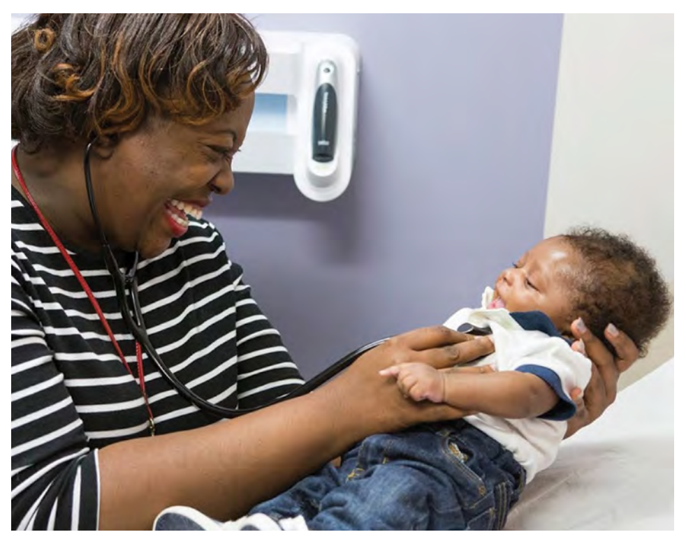
Conway Health and Resource Center.